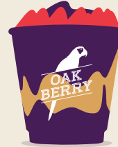
ONE OAK 10oz / 28 SR