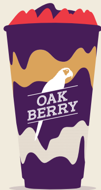
THE OAK 20oz / 45 SR