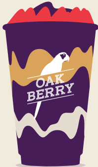
WORKS 16oz / 40 SR