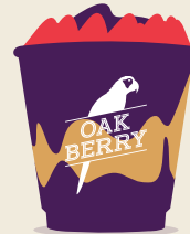
ONE OAK 10oz / 28 SR