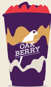
CLÁSSIC 12oz / 35 SR